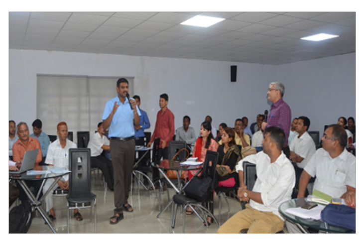
SPD ARIASS interacting with the FPOs