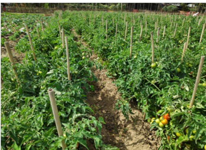
Figure-3: Staking in tomato plants (Rabi 2018-19)

"After learning protected nursery management and staking from WorldVeg, I was able to grow disease-free plants, achieve higher yields and better market acceptability."