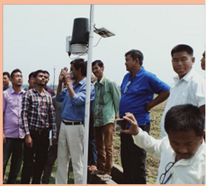
Automatic Weather stations being set up in the blocks