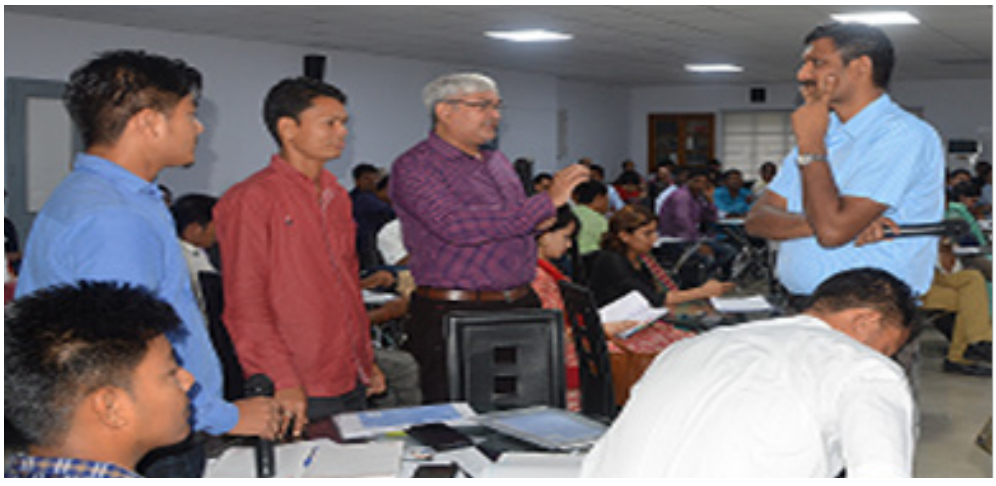
FPOs interacting during the Workshop