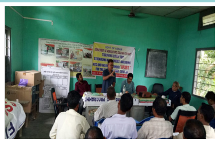
Financial Education and Counseling Camps in progress