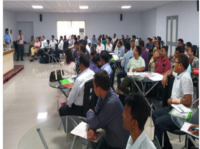
Review of ATMAs in progress