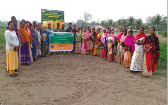
Participatory Varietal Selection Workshop at Vegetative and Harvest Stages involving key-stakeholders