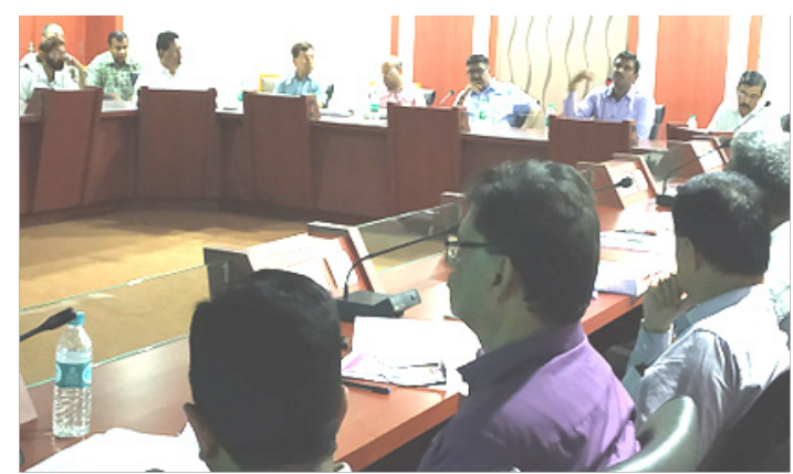
34th Meeting of the Governing Body (GB) of ARIAS Society